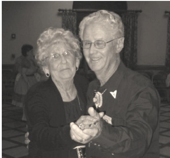
235 Banner Raids